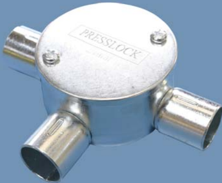
METAL 3 WAY SHALLOW JUNCTION BOX