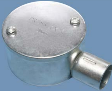
METAL 1 WAY SHALLOW JUNCTION BOX