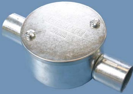
METAL 2 WAY SHALLOW JUNCTION BOX