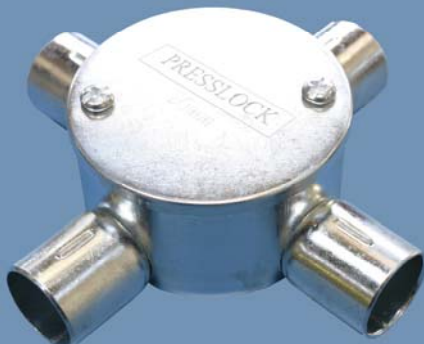
METAL 4 WAY SHALLOW JUNCTION BOX